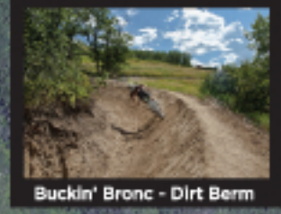
Buckin' Bronc - Dirt Berm