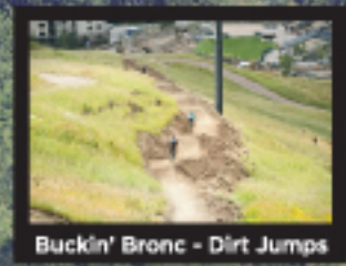
Buckin' Bronc - Dirt Jumps