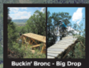
Buckin' Bronc - Big Drop