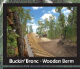
Buckin' Bronc - Wooden Berm