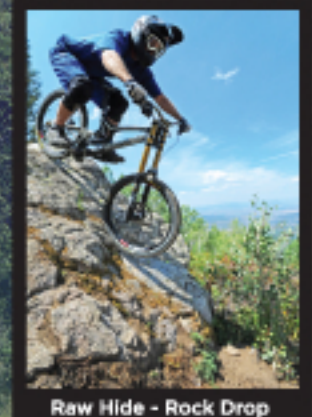
Raw Hide - Rock Drop